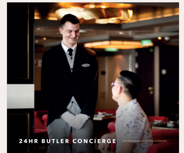
24HR BUTLER CONCIERGE