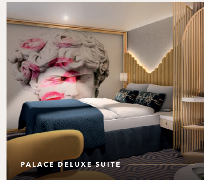
PALACE DELUXE SUITE