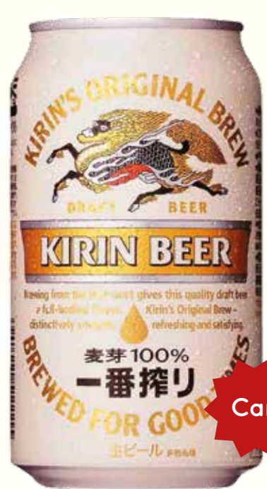
KIRIN BEER $7.50 ++