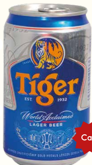
TIGER BEER $7.50 ++