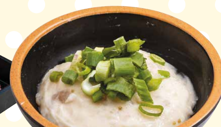
SEAFOOD MEAT BALL