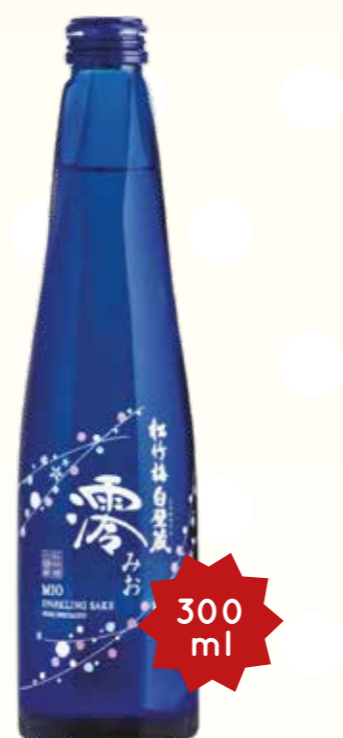
MIO SPARKLING SAKE $18.00 ++