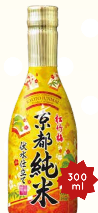
TAKARA KYOTO FUSHIMIZU JITATE JUNMAI $20.00 ++