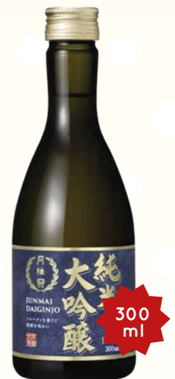
GEKKEIKAN JUNMAI DAIGINJO $29.90 ++