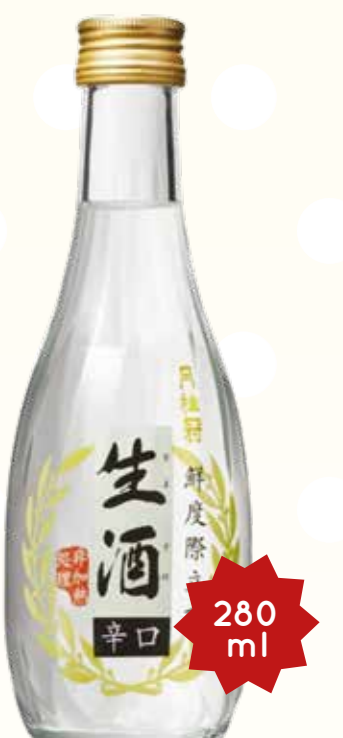
NAMA SAKE $25.90 ++