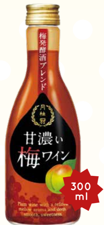
GEKKEIKAN PLUM WINE $19.00 ++