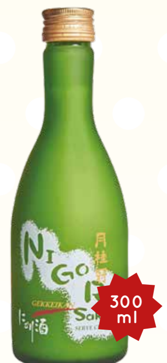
NIGORI $25.90 ++