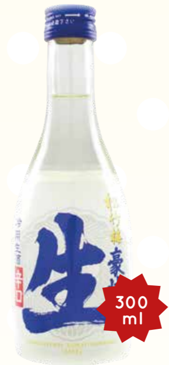
TAKARA SHOCHIKUBAI GOKAI NAMA SAKE $16.90 ++