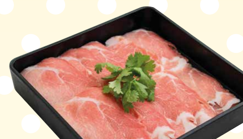
DUROC PORK COLLAR

TRUFFLE MUSHROOM 西洋松露 A heartwarming luxurious broth combining earthy mushrooms with truffle flavours, a must-try for truffle lovers.