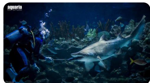
▲ Aquaria KLCC

Simple reservation steps on Klook! Show your e-voucher at the entrance and you're good to go!