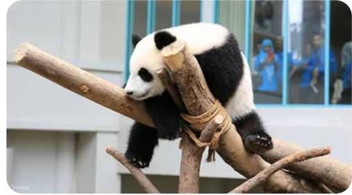
▲ Zoo Negara (National Zoo)