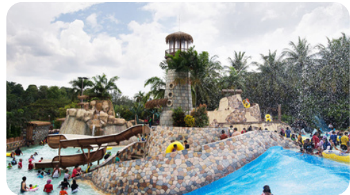
▲ Wet World Waterpark Shah Alam

Simple reservation steps on Klook! Show your e-voucher at the entrance and you're good to go!