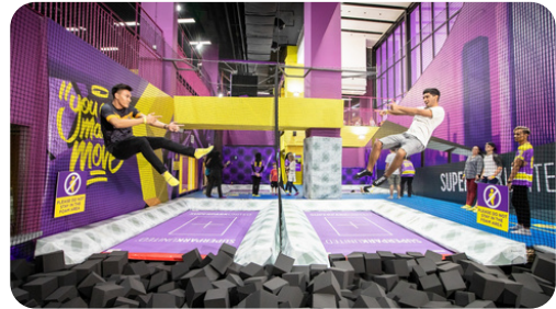
▲ SuperPark KL