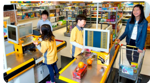
▲ Kidzania Kuala Lumpur