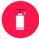
Hand sanitiser dispensers