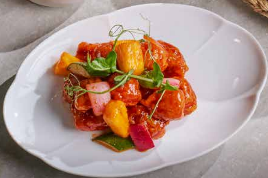
Sweet and Sour Kurobuta Pork