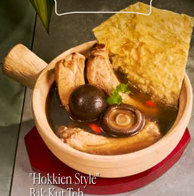
"Hokkien Style" Bak Kut Teh