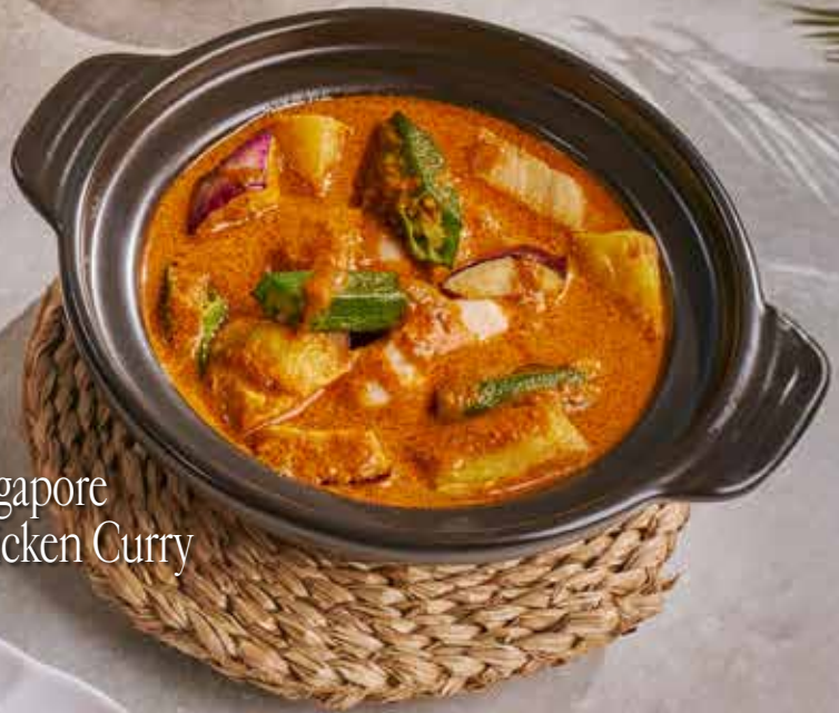
Singapore Chicken Curry