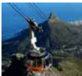
TABLE MOUNTAIN AERIAL CABLEWAY