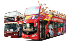
Singapore7's alliance fleet of topless buses

Flag a RED or BROWN Topless Bus (just not the dull Orange bus).