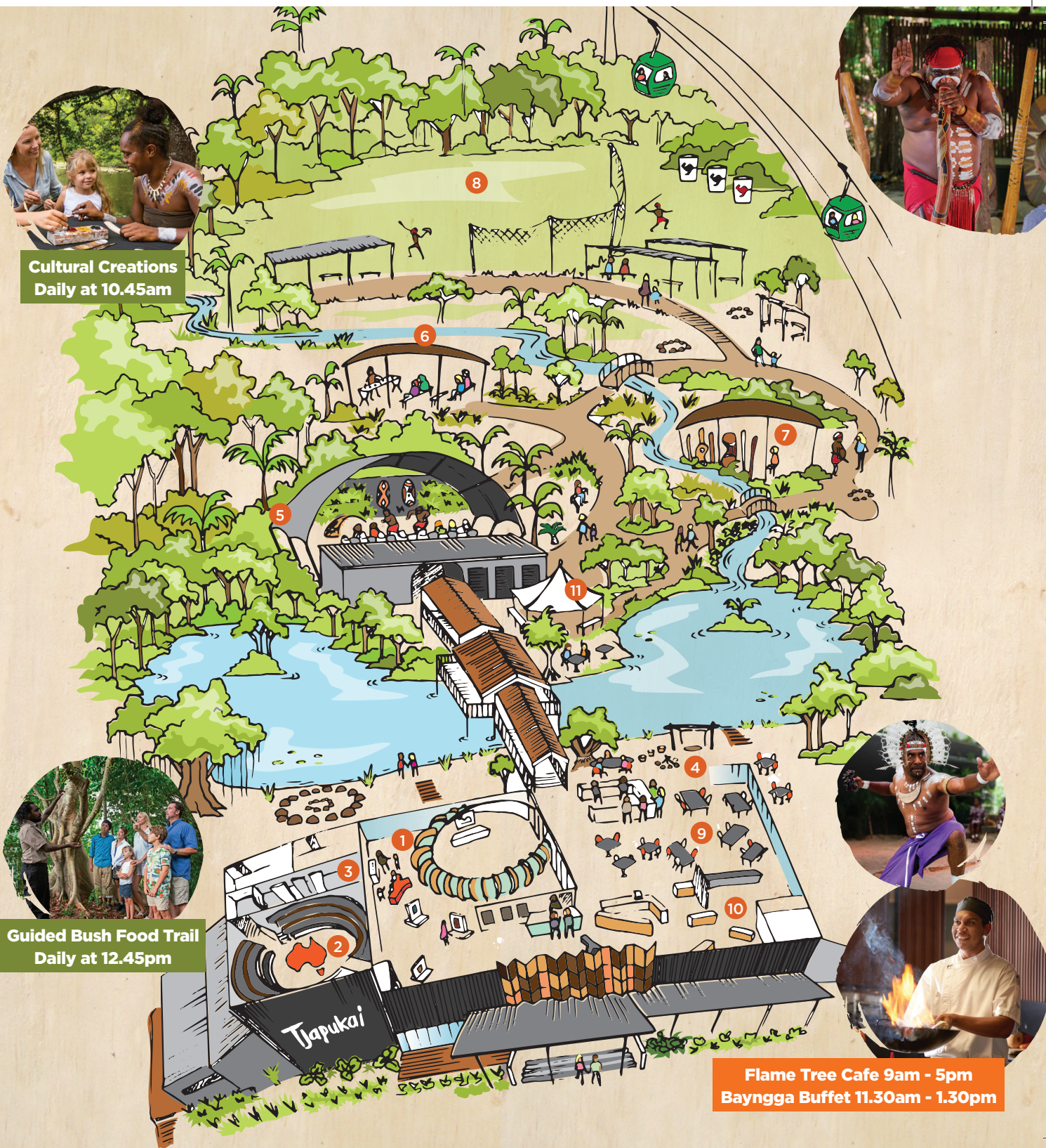
Cultural Creations Daily at 10.45am