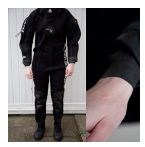
Layer 3: Drysuit