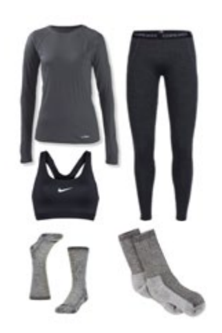
Layer 1: Base Layer